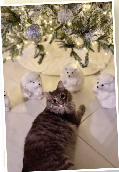
photo under a beautifully decorated tree. Civic's playful spirit perfectly embodied the holiday season. As the winner, Civic receives a special prize and a feature in our newsletter. Congratulations to Civic and their owner for spreading joy and cheer!

Excitement filled the air as we announced the winner of our Holiday Pet Photo Contest! This year's champion, Civic the Cat, captured our hearts with a heartwarming